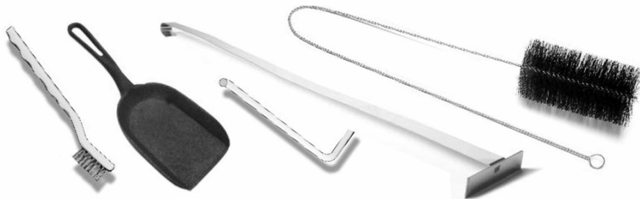
Fig. 4 - Tools for Cleaning and Maintenance